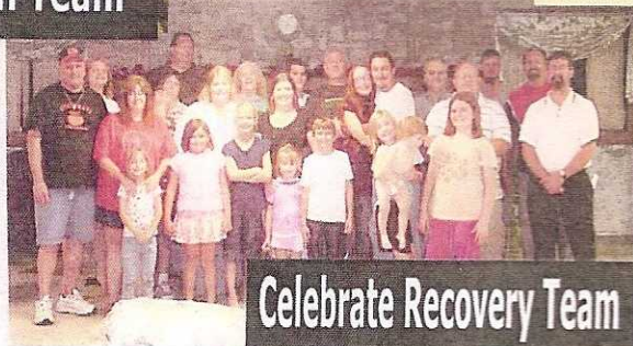
Celebrate Recovery Team

simplechurch clarity movement alignment focus